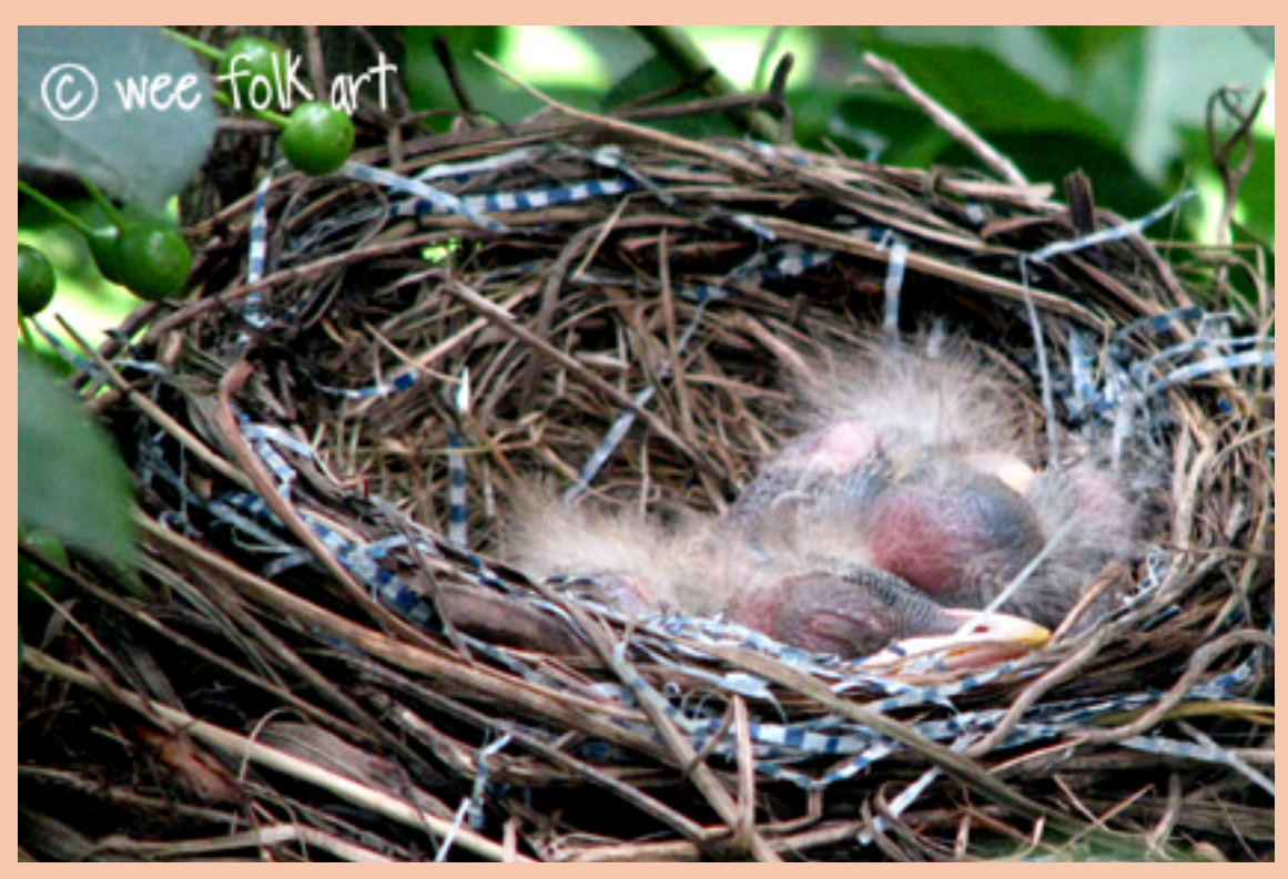
(Preschool-Kindergarten / Ages 4-6)

Please Note: I have developed these curriculum materials to use with my own family. I am not offering any legal advice on homeschooling nor can I gaurentee in any way that these materials will meet your state standards for education. It is up to you to be sure your family is working within your state's guidelines. I will try to keep all links/book lists current but obviously use caution when visiting websites and note that book availibilies change all the time. In most cases you should be able to find a suitable replacement.